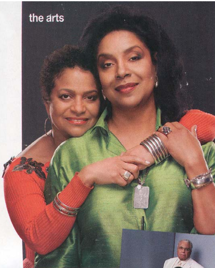
Director Debbie Allen and Cat star Phylicia Rashad; "the dream cast" of Cat on a Hot Tin Roof